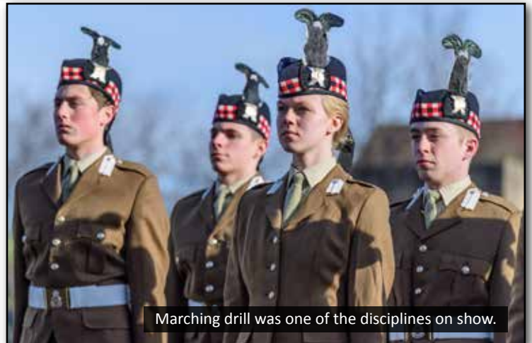
Marching drill was one of the disciplines on show.