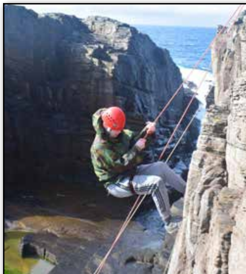
Rock climbing at Yesnaby, West Mainland.

During the Easter holidays ACF cadets from Orkney, Shetland and Buckinghamshire met on Orkney for Exercise Orcadian Sunrise 2017, their annual week-long exchange programme.