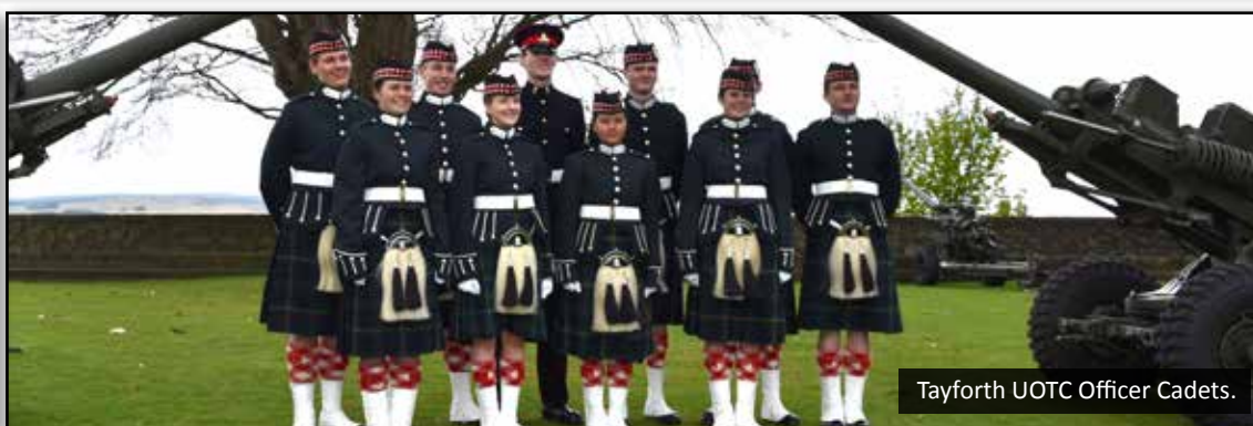
Tayforth UOTC Officer Cadets.