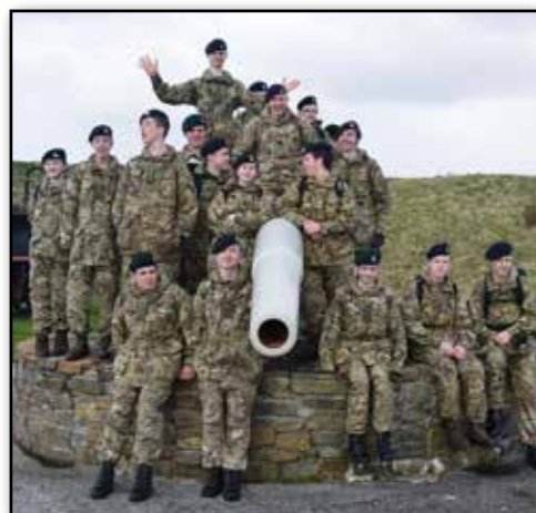
A trip to Lyness Naval Museum, Hoy.