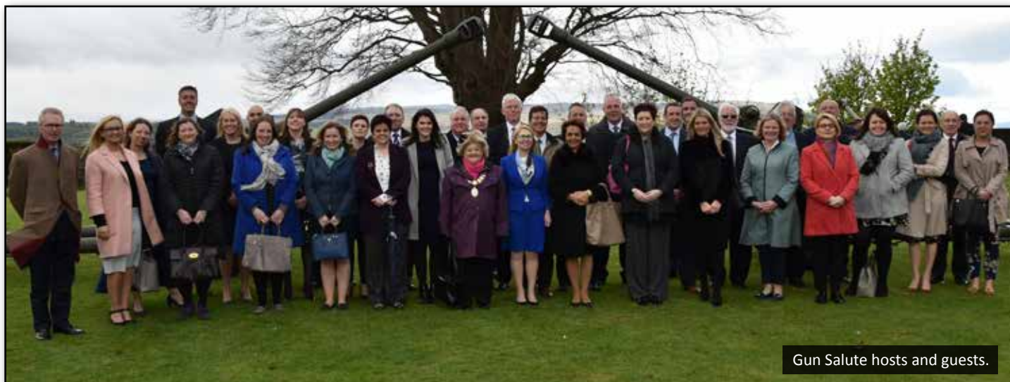
Gun Salute hosts and guests.