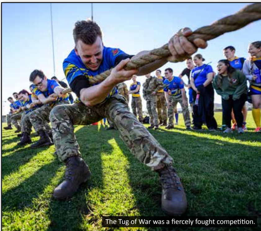
The Tug of War was a fiercely fought competition.