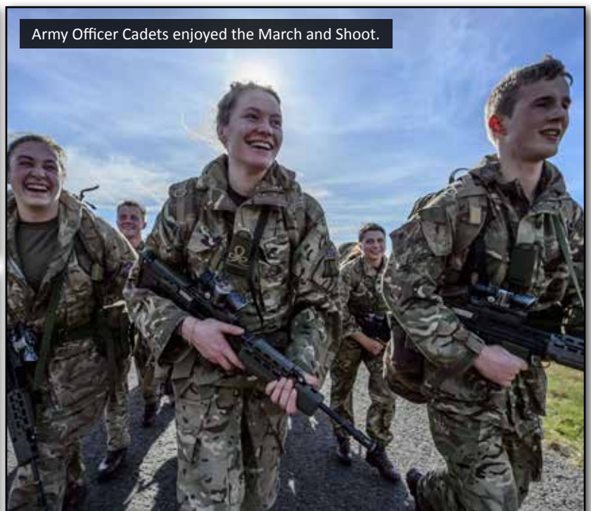
Army Officer Cadets enjoyed the March and Shoot.