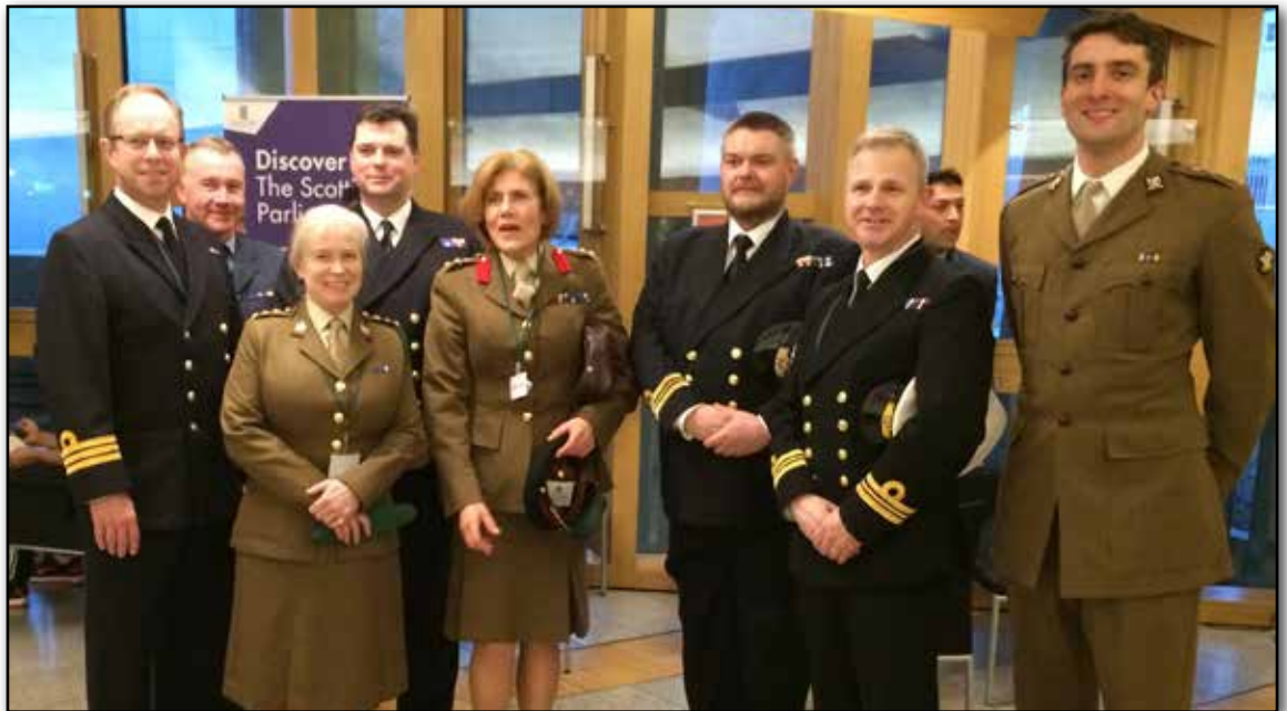
The Armed Forces were well represented at the Parliament.