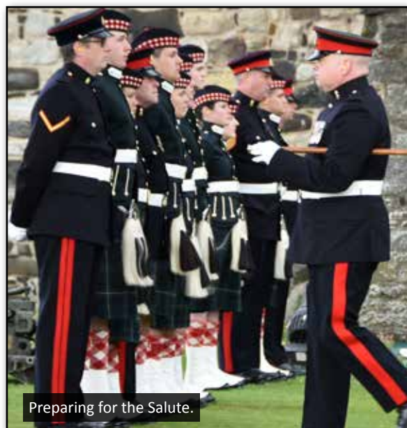
Preparing for the Salute.

Following the successful firing – which was also watched by proud friends and families of the Officer Cadets – and inspection of the crews, guests returned to the museum for a light lunch.