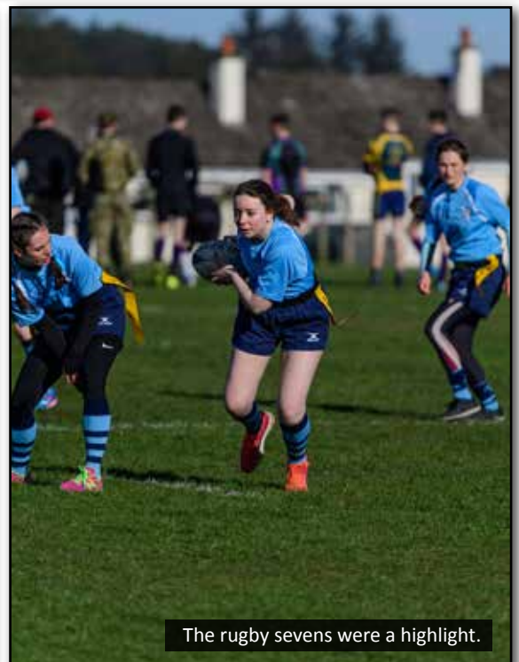
The rugby sevens were a highlight.