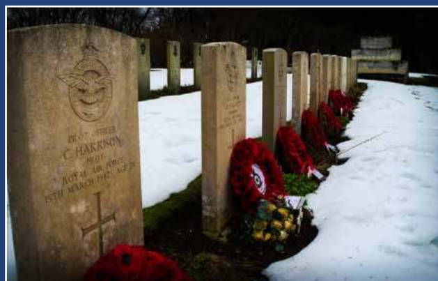
Right: Wreaths were laid at the graves of the air crew at the Commonwealth War Grave Cemetery in Fossvogur.