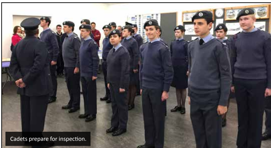
Cadets prepare for inspection.