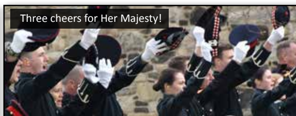
Three cheers for Her Majesty!