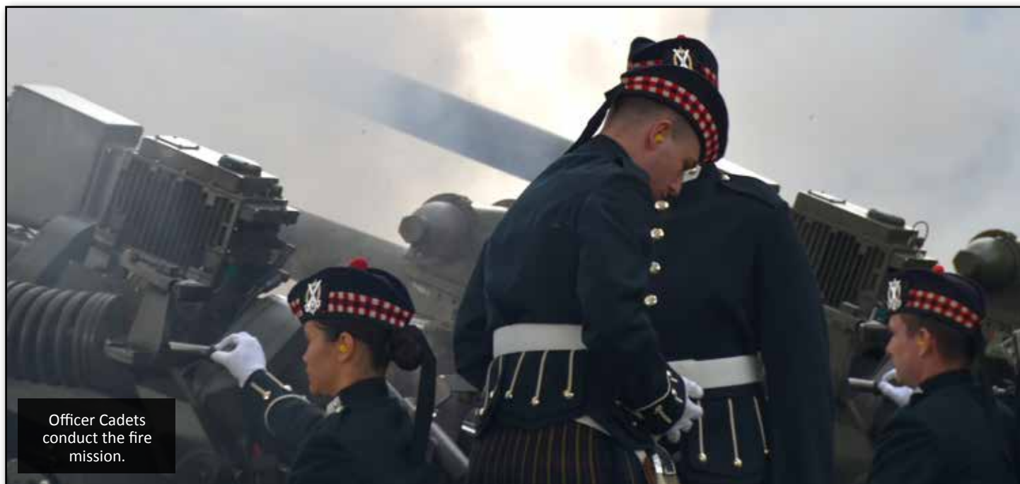
Officer Cadets conduct the fire mission.