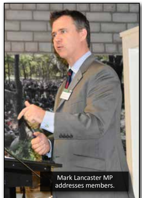
Mark Lancaster MP addresses members.