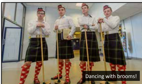
Dancing with brooms!