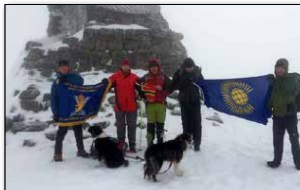
The team from 1st Battalion the Highlanders ACF on top of a snowy Ben Nevis.