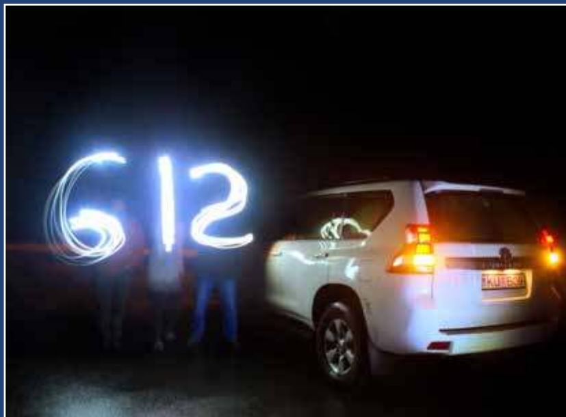
Above: Members of 612 Sqn make their mark.

Now an RAF Medical Reserve Squadron, 612 recruits and trains medical professionals to serve with the RAF Reserves.