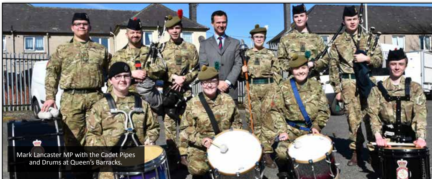
Mark Lancaster MP with the Cadet Pipes and Drums at Queen's Barracks.

This year's HRFCAs Annual Association Meeting (AAM) took place on Saturday 25 March at Queen's Barracks in Perth.