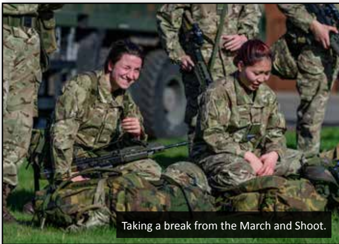
Taking a break from the March and Shoot.