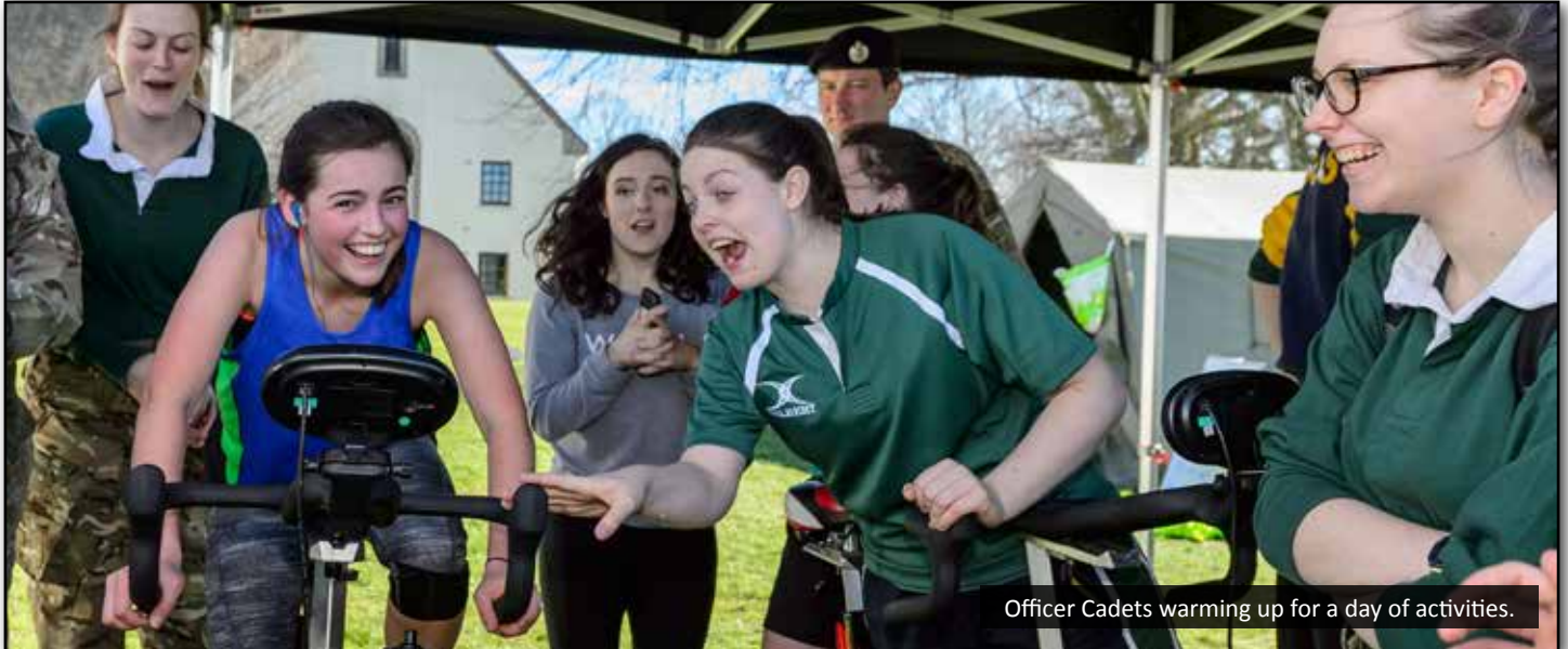
Officer Cadets warming up for a day of activities.