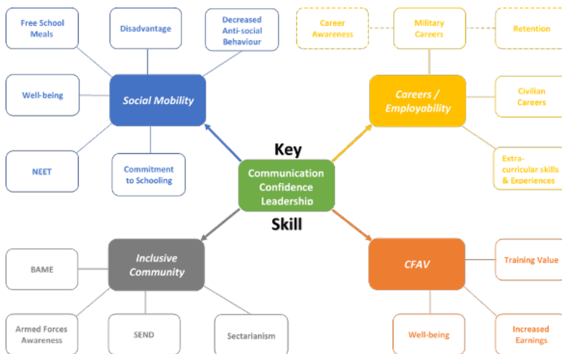
Figure 2 - The different areas of social impact that emerged from the primary data collection