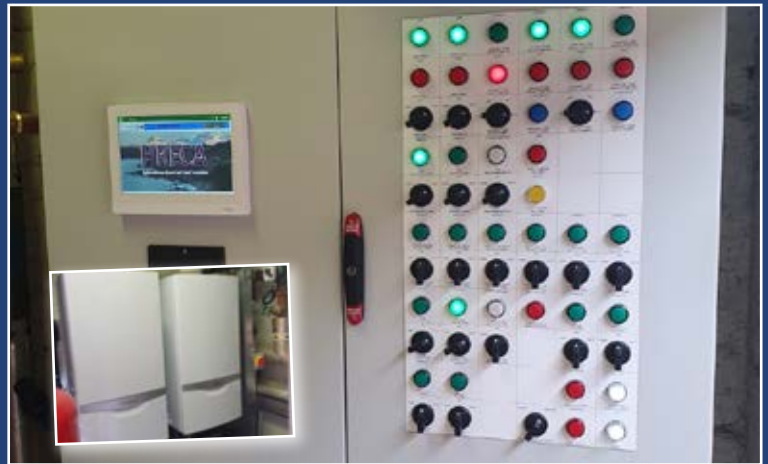
A new heating system has been installed at the Stirling Army Reserve Centre.

Other recent improvements include: Extensive repointing at Gordon Barracks, Aberdeen; External refurbishment and new offices at Alness ATC; Refurbishment works at Ardersier ACF detachment; Extensive refurbishment work at Forres joint cadet centre; new boilers at the Arrochar Cadet Training Centre; and new kitchens at the married quarters surrounding our Dundee HQ.