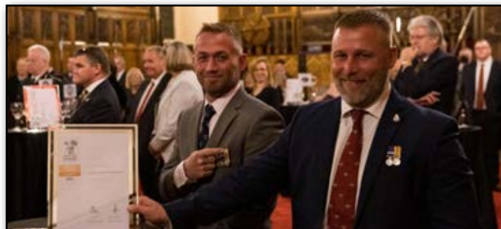
Horizon Security Solutions Ltd were delighted with their award.