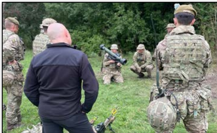
7SCOTS soldiers discussing and demonstrating the equipment and techniques needed to knock down a wall.