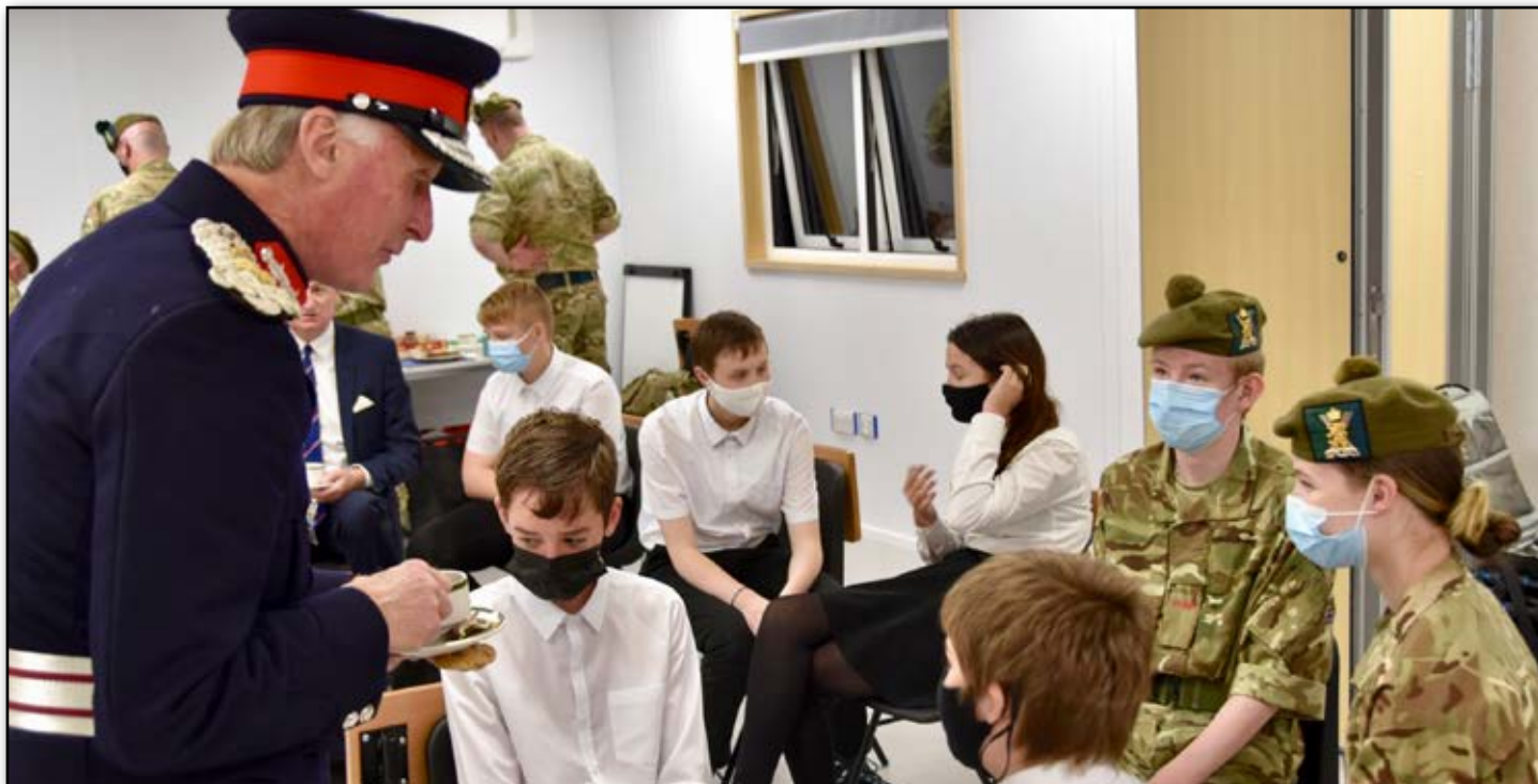
The Lord-Lieutenant chats with cadets and new Bo'ness detachment recruits.