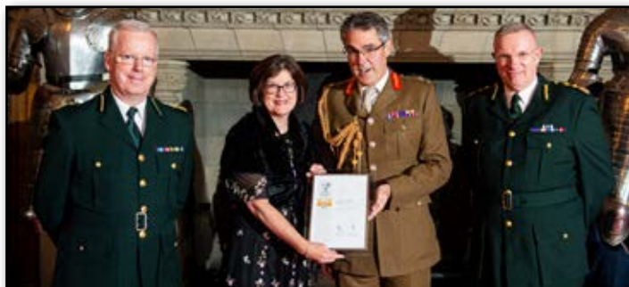
Scottish Ambulance Service representatives with Lt Gen Swift.

For a full gallery of images, visit www.hrfa.co.uk .