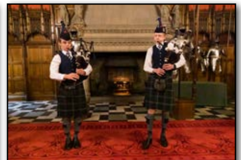
Pipers from George Heriot's provided music.