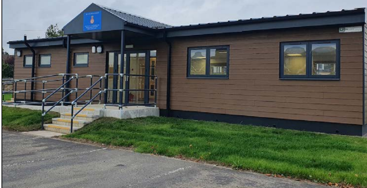
The new modular cadet building at Bo'ness cost £340,000.