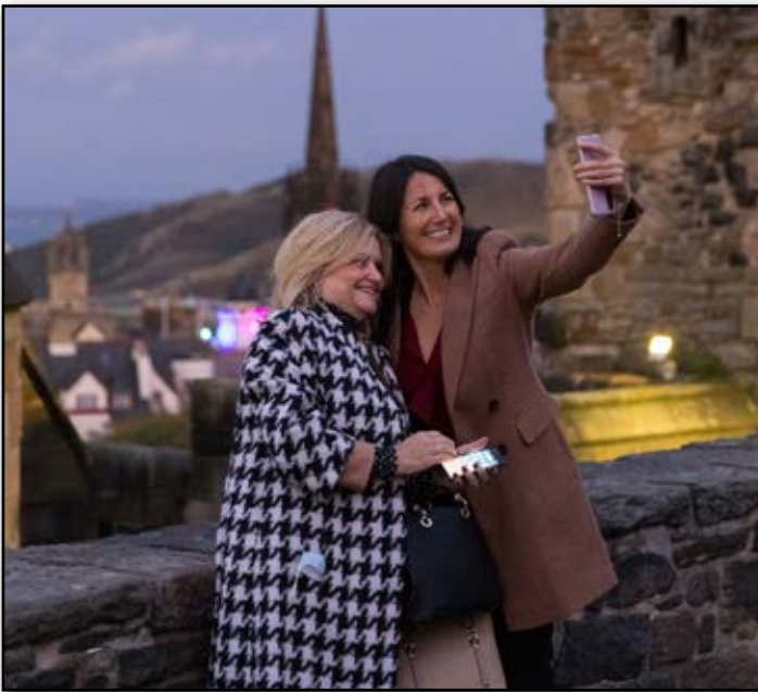
Fife Chamber of Commerce attendees prior to the event.