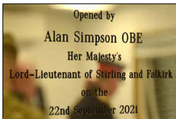
The new modular building at Bo'ness was opened by the Lord-Lieutenant of Stirling and Falkirk. See pages 4 & 5.