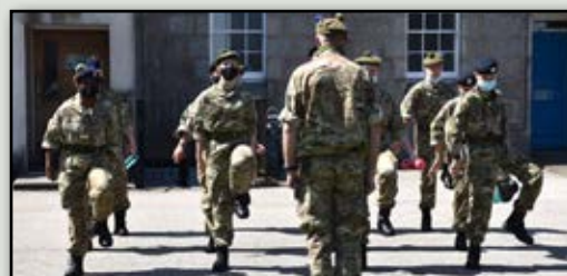
2 Highlanders cadets being put through their paces.