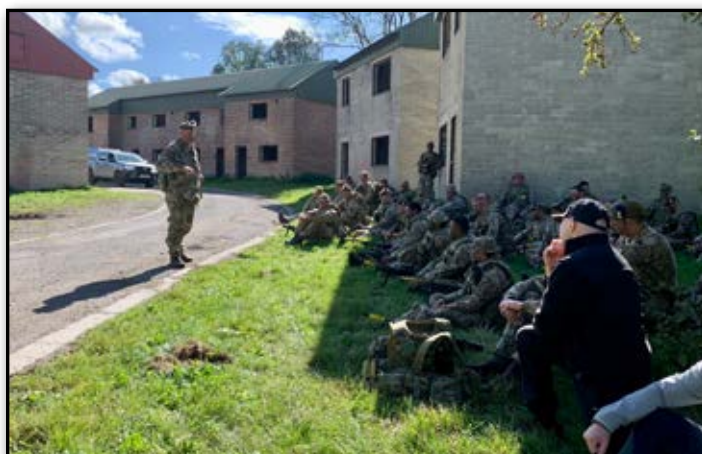
Employers observing 7SCOTS training at Imber Village.