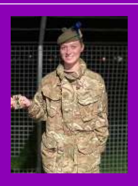
Promotion for Daisy

Armed Forces Covenant and Veterans report