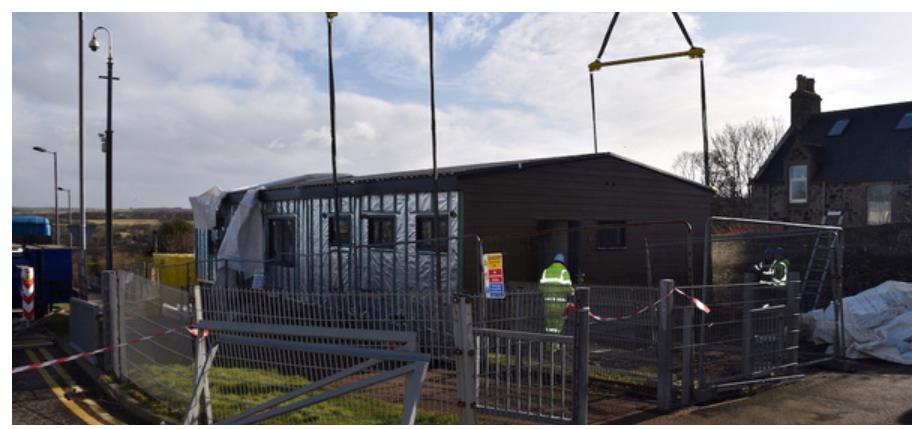
The new building arrived on site in five prefabricated sections.