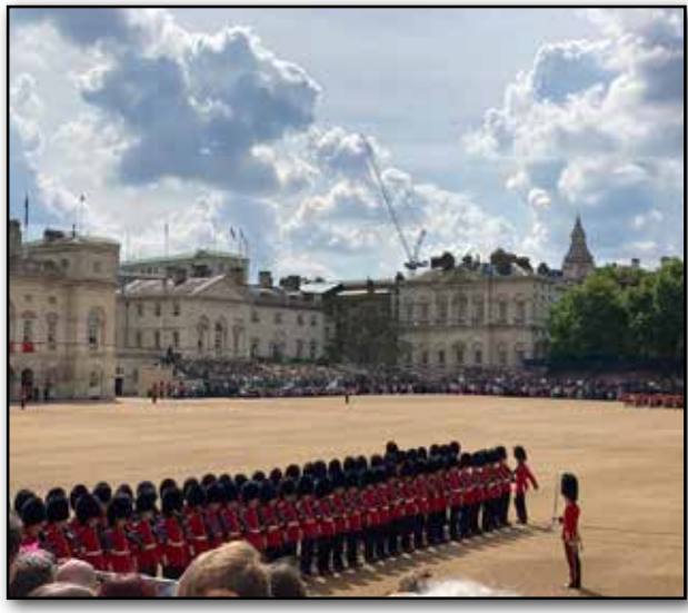
Trooping the Colour at Horseguard's Parade.