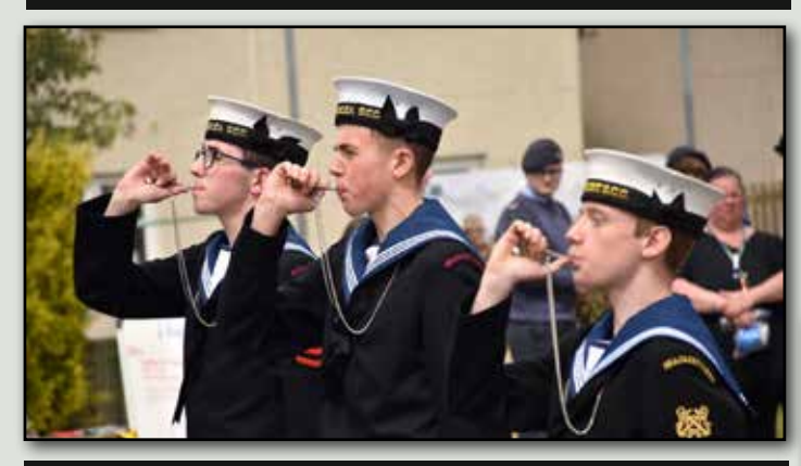
Sea Cadets gave a piping demonstration while (below) there were first aid, line throwing and command task stands on offer to visitors.