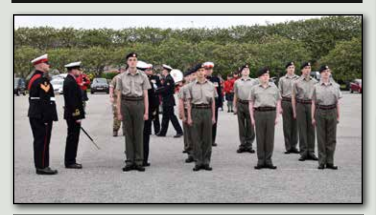
Royal Marine Cadets.