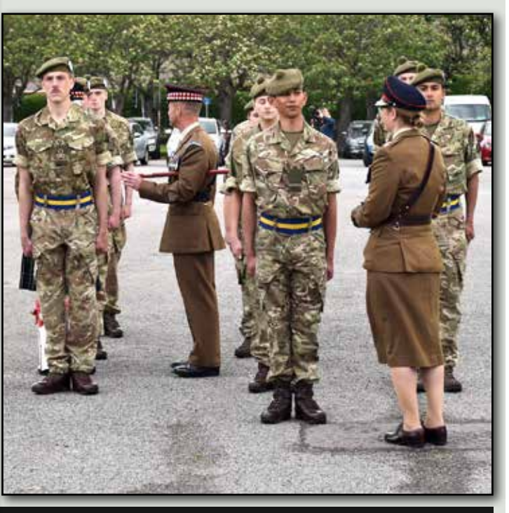
Aberdeen UOTC cadets being inspected.