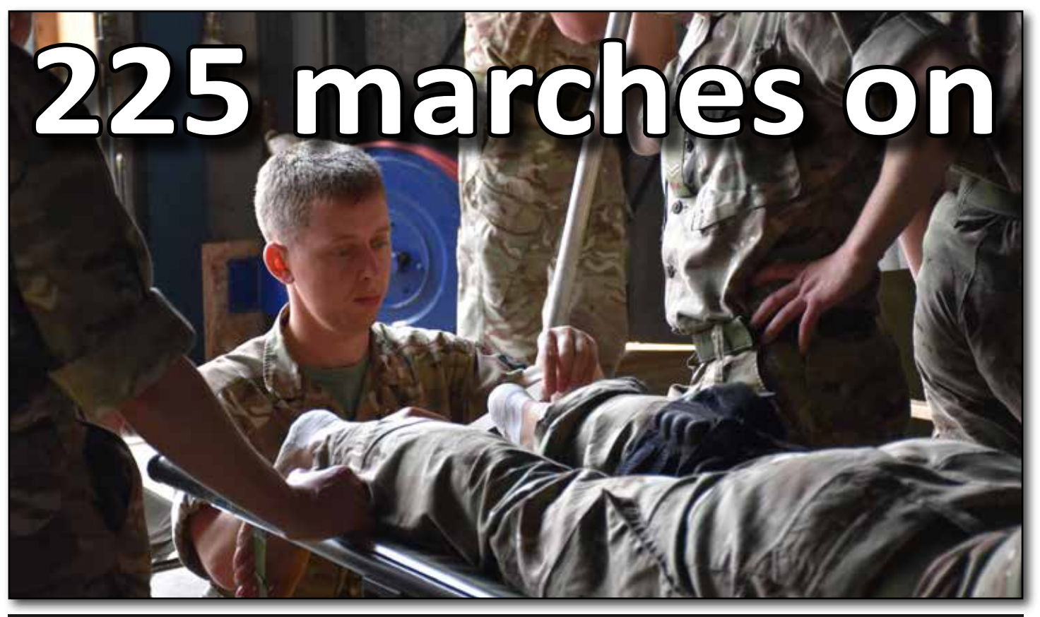
Medics taking part in simulated first aid training ahead of the Nijmegen Marches.