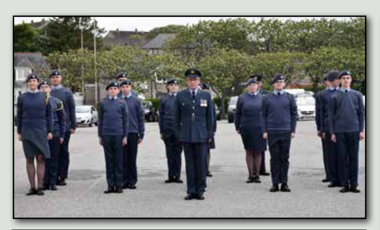
RAF Air Cadets await inspection.