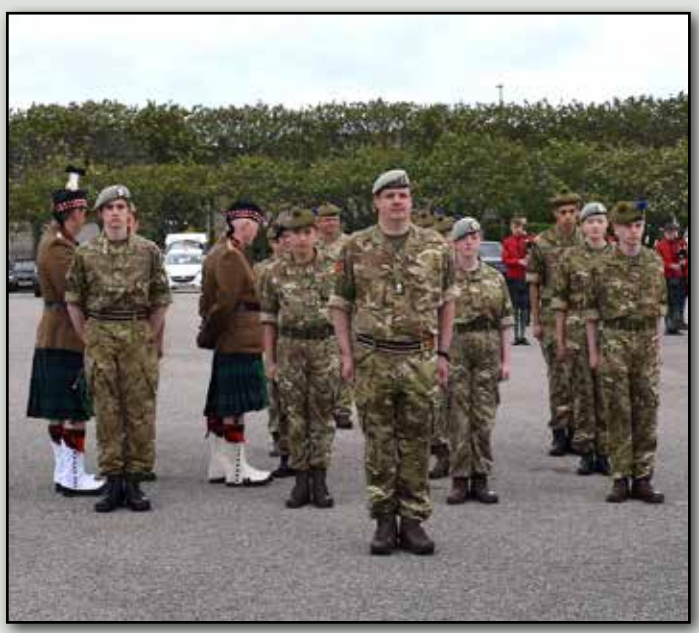
2 Battalion the Highlanders ACF cadets and adults.