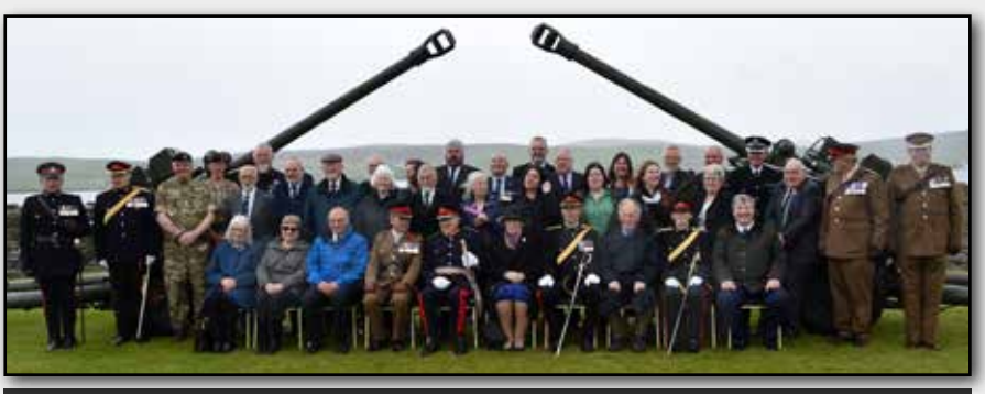
Guests and dignitaries who attended the Feu De Joie.