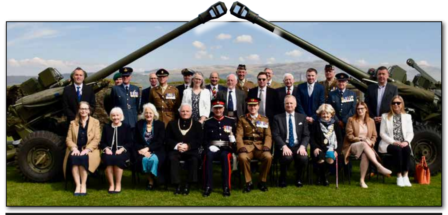
Guests and dignitaries at Stirling Castle.