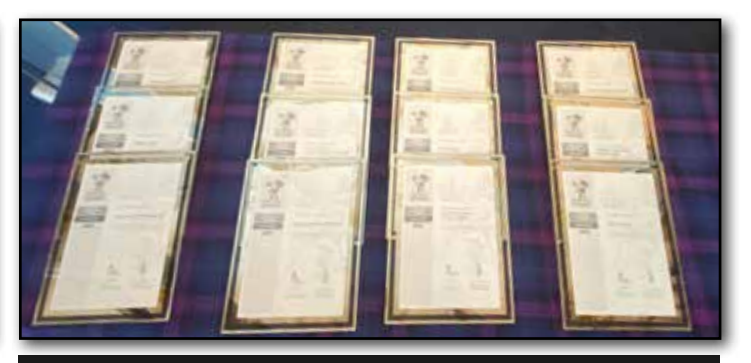
ERS Silver Award certificates.