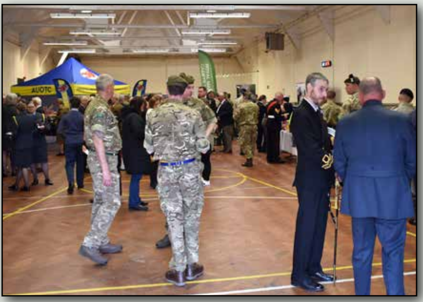
There were static displays for guests to enjoy over lunch.