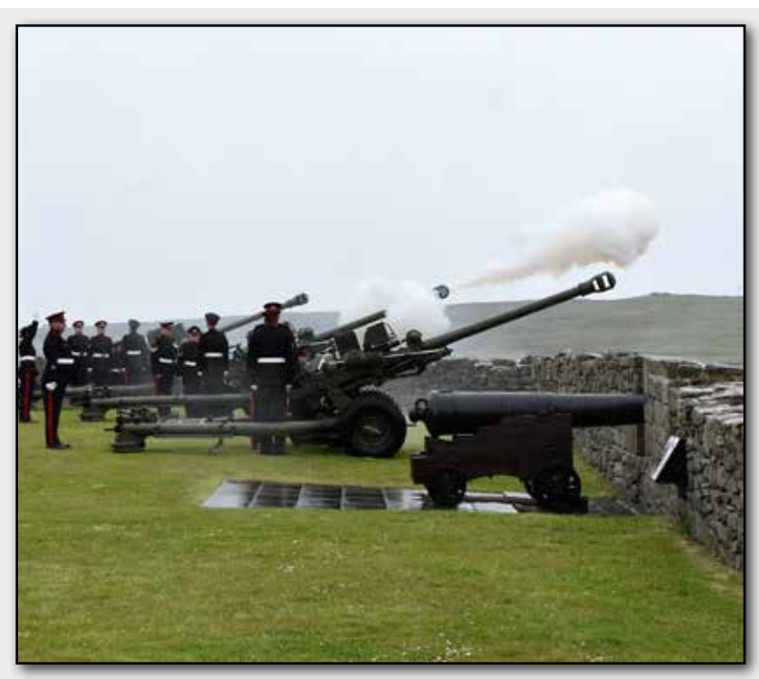
The gunners from 212 (Highland) Battery fire the Salute.