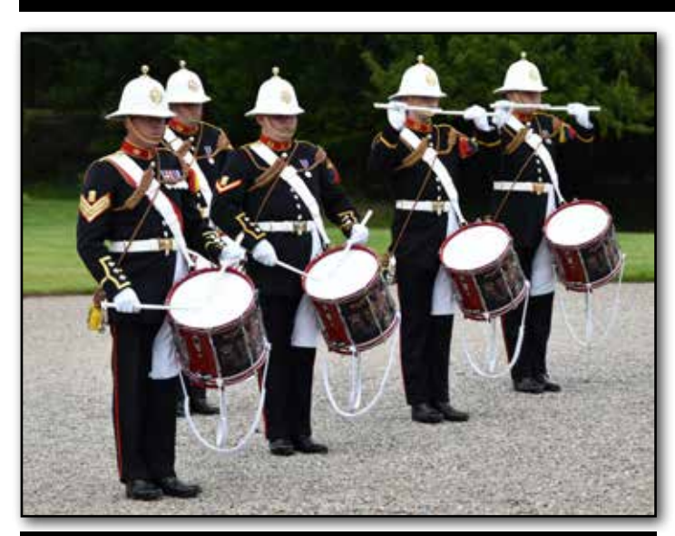
The Royal Marines Scotland Corps of Drums.