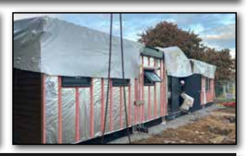
Left: One of the modules. Right: With all sections in position, work begins on making the building ready for cadets.