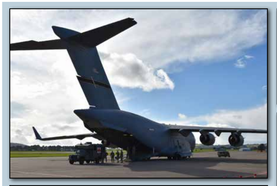
Medical Reservists load a 'casualty' onto a USAF C-17. Above right: Visitors watch as the Reservists prepare to move the casualty. Right: The visitors had the chance to see inside the C-17.