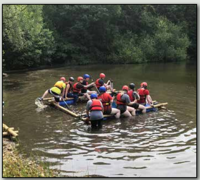
Cadets take to the water at Strensall.