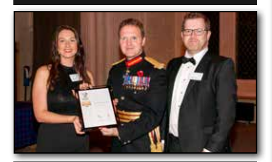
Moray Chamber of Commerce.