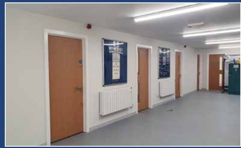
The refurbished drill hall.