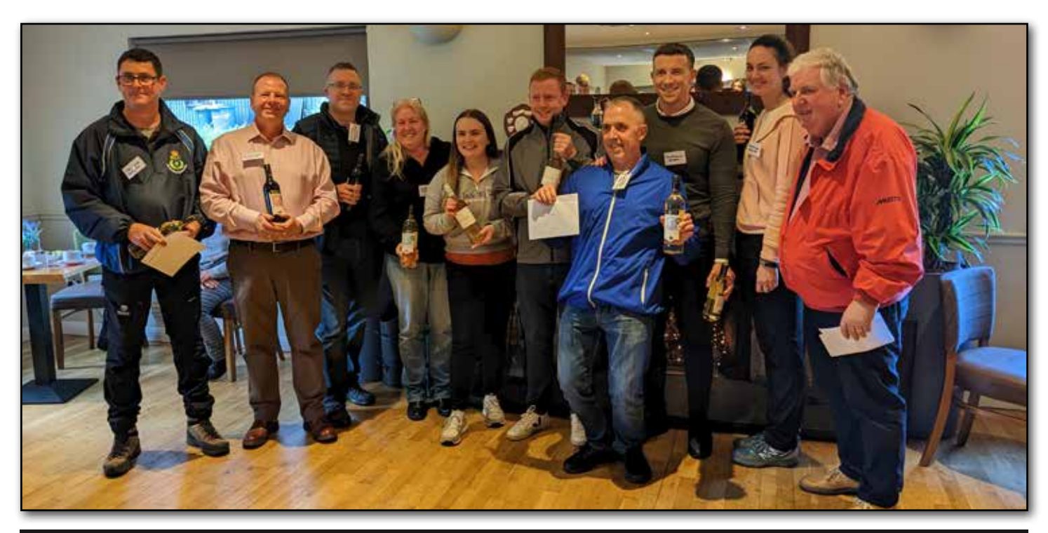
The winning team celebrate their success.