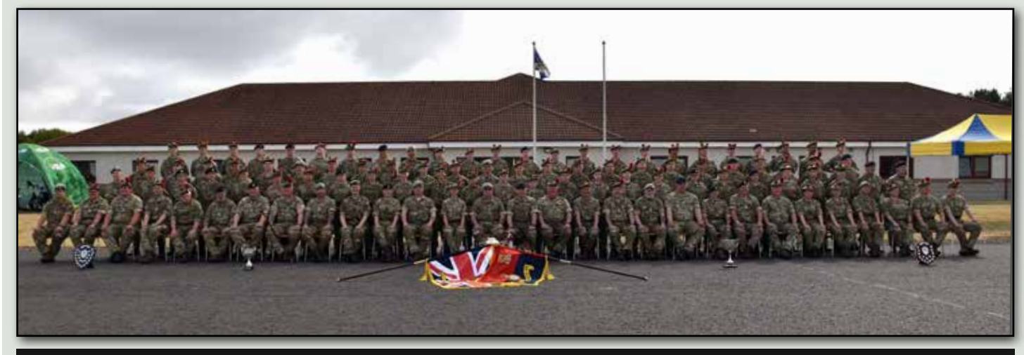
Angus and Dundee Battalion ACF at the Barry Buddon Training Area.