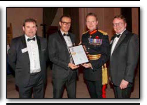
Dunbartonshire Chamber of Commerce.