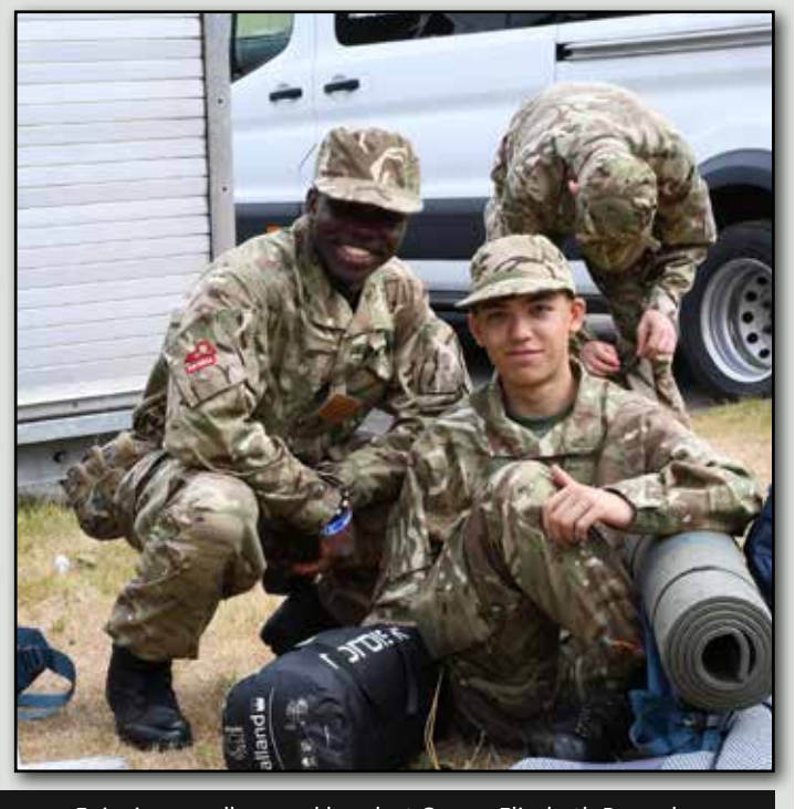
Enjoying a well-earned break at Queen Elizabeth Barracks.