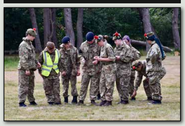
Angus and Dundee cadets enjoying a navigation exercise.