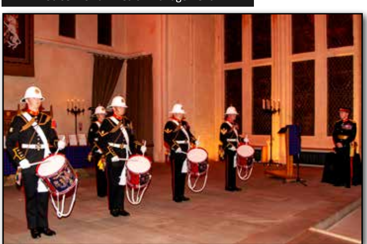
The Royal Marines Scotland Corps of Drums performed.