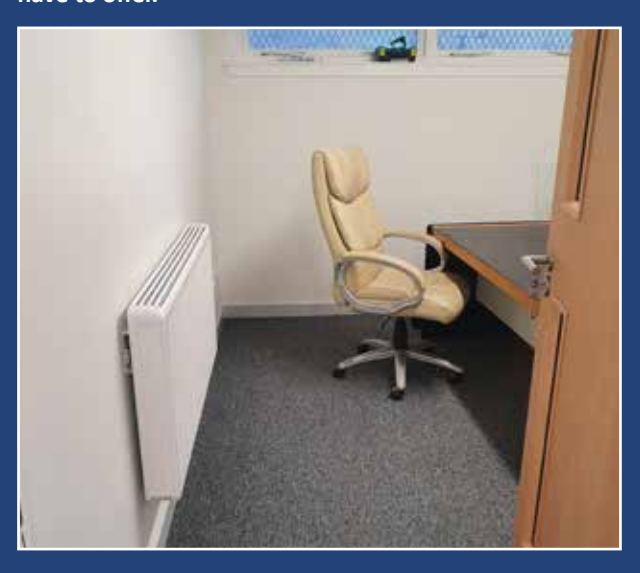
A fresh look for one of the offices at 383 (Alloa) Squadron.

The improvements will benefit both the cadets and the Adult Volunteers of the Squadron, giving them an improved space in which to train, learn and enjoy all the fun activities the Service Cadet organisations have to offer.