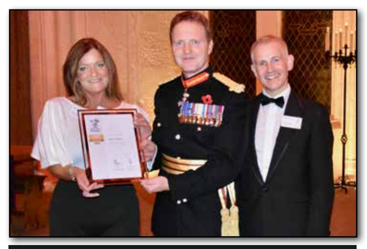
Sport Aberdeen were delighted with their award.

Recipients in the Highland RFCA area: Abertay University; Dunbartonshire Chamber of Commerce; Dundee & Angus