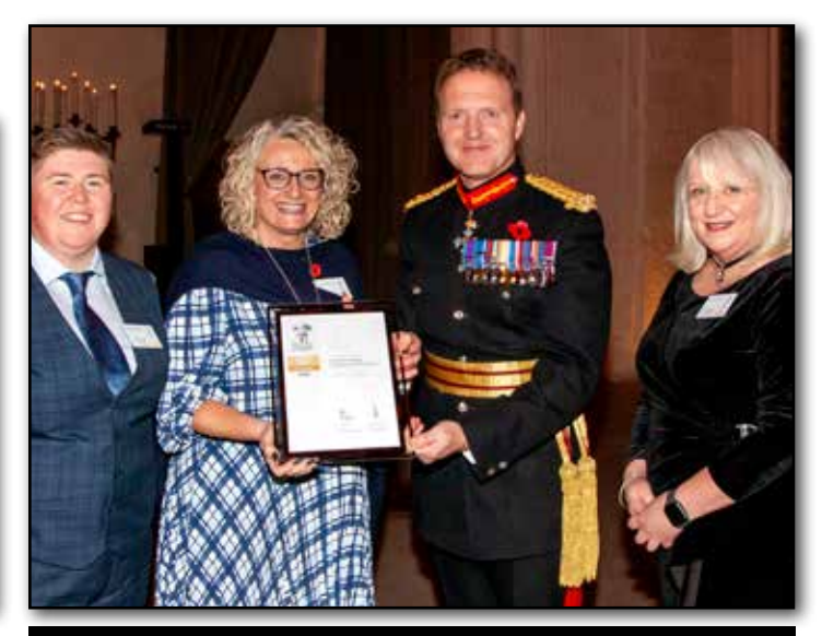
Dundee & Angus Chamber of Commerce.