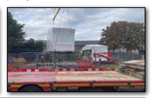
The sections arrived by lorry before being removed by crane and moved into place.