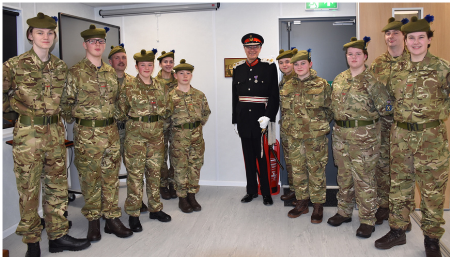
The Lord-Lieutenant with 2 HLDRA ACF cadets and adult volunteers.

The Lord-Lieutenant and guests were then given a tour of the facility, followed by a buffet.