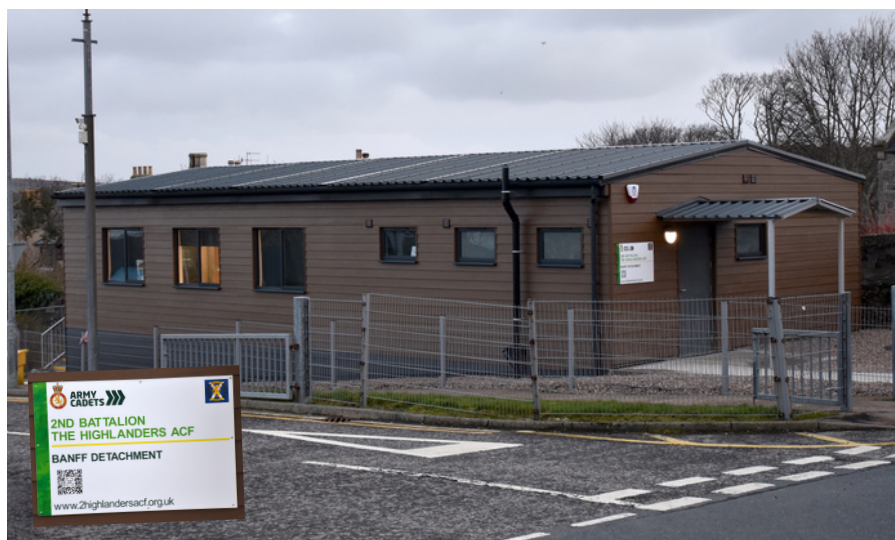
The new building in Banff.