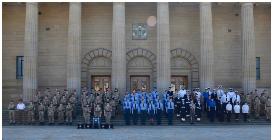
Some of the cadets and adult volunteers who took part.