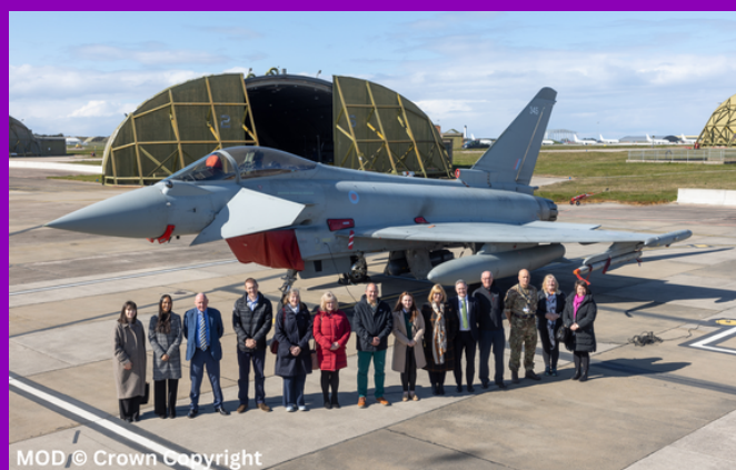
Some of the visitors in front of the Typhoon FGR4.

A senior engineering officer and two pilots led an in-depth tour of the Typhoon FGR Mk 4. The II (AC) Squadron visit finished in the pilots' crew room where they showcased some of their safety equipment and attire. The employers praised the Typhoon Squadron visit as the highlight of the