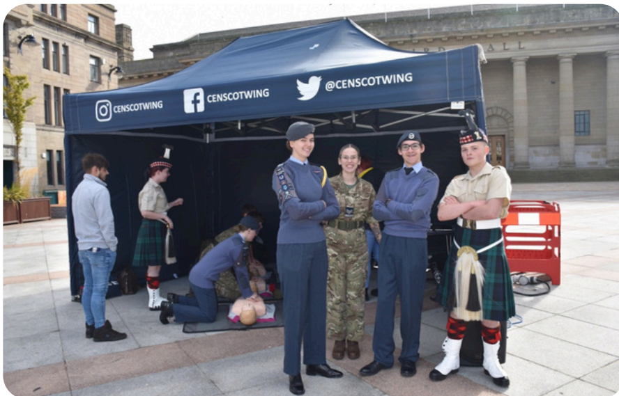
The Royal Air Force Air Cadets first aid stand.