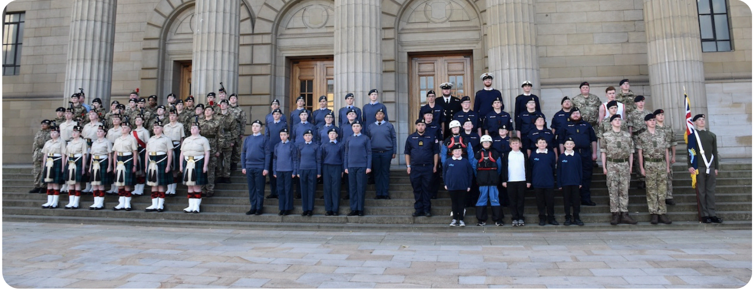
Cadets and Cadet Force Adult Volunteers in front of the Caird Hall.