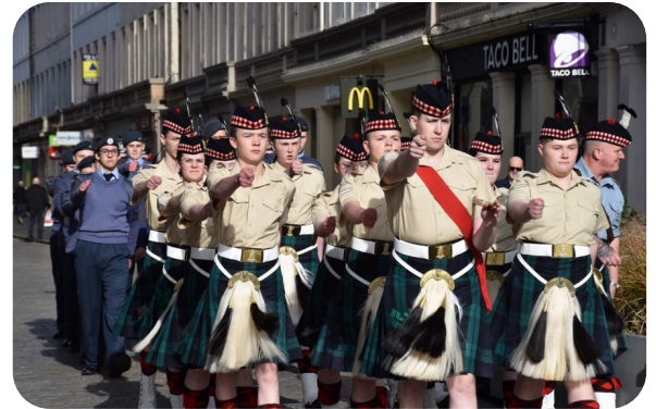
The parade makes its way down Reform Street.