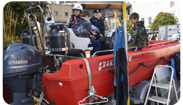
Visitors on the Rigid Inflatable Boat.