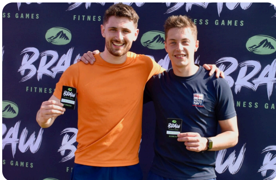
The team from HMS Scotia show off their finisher patches.