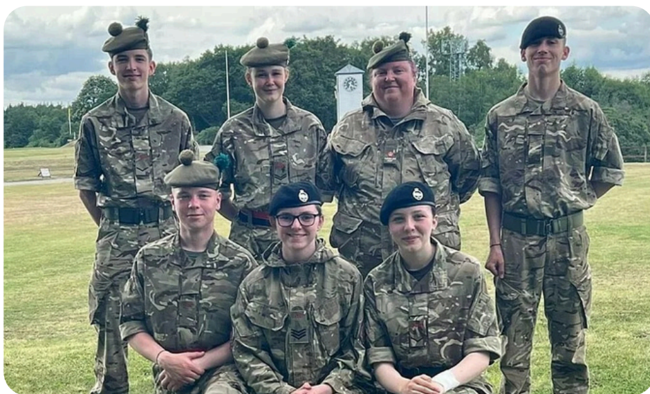
The shooting team from The Argyll and Sutherland Highlanders Battalion ACF with an Adult Volunteer.