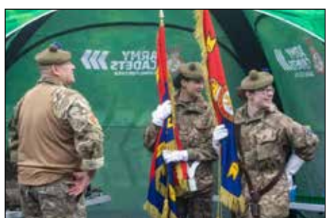
The ACF Colour Bearers.