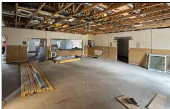
The existing dining area is increasing in size.