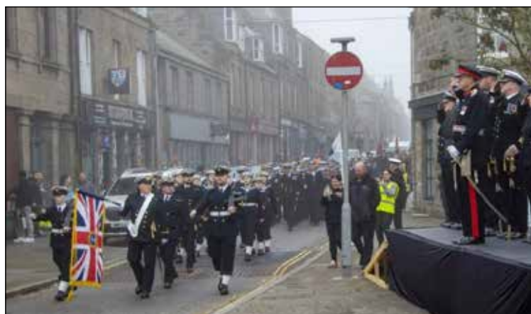
Taking the Salute.