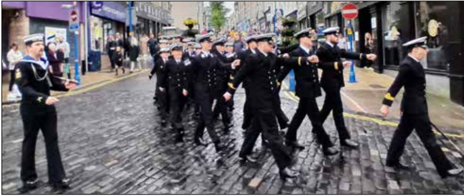
The Ship's Company parading through Dunfermline and (right) the 30th Anniversary cake.