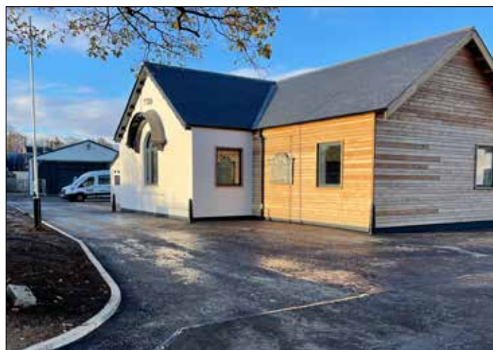
The completed extension at Dingwall.

In addition, solar panels were installed on the Highlander accommodation block.