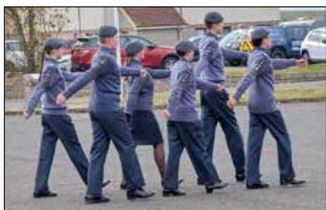
Cadets demonstrate their drill skills.

Each inspirational young person is invited to use the post-nominals BCyA as a legacy of their achievements and commitment to others.