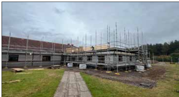
The exterior of the multifunctional extension.