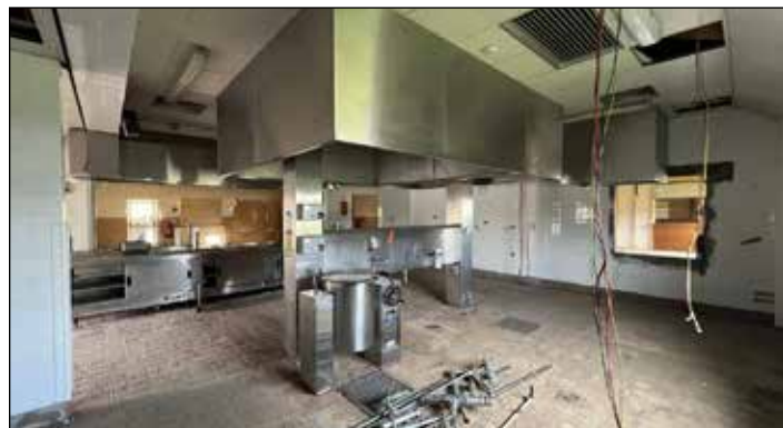
Kitchen facilities are being upgraded.