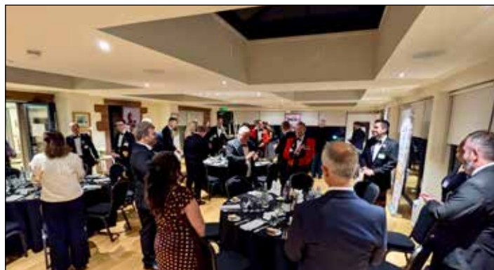
Following the presentations, hosts and guests enjoyed a meal.