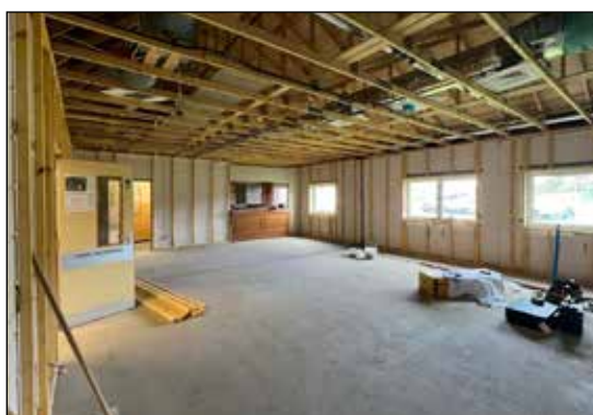
The officers' dining area is being refurbished.