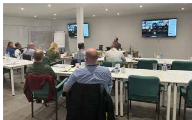
Left: The Lochgelly meeting and (right) the members who joined the latest meeting in Stirling virtually.