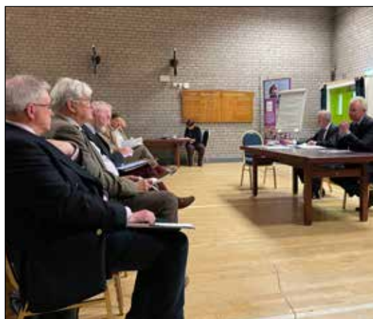
The Chief Executive updates the Southern Area Meeting.