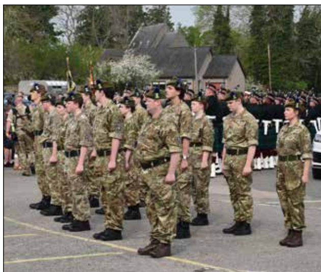
Left: The Regiment marching through Laurencekirk and (above) Army Cadets forming up in Alford.