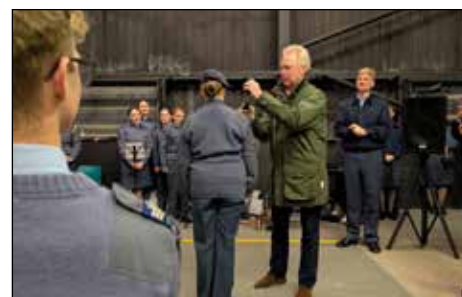
Brigadier Dodson promotes a cadet.