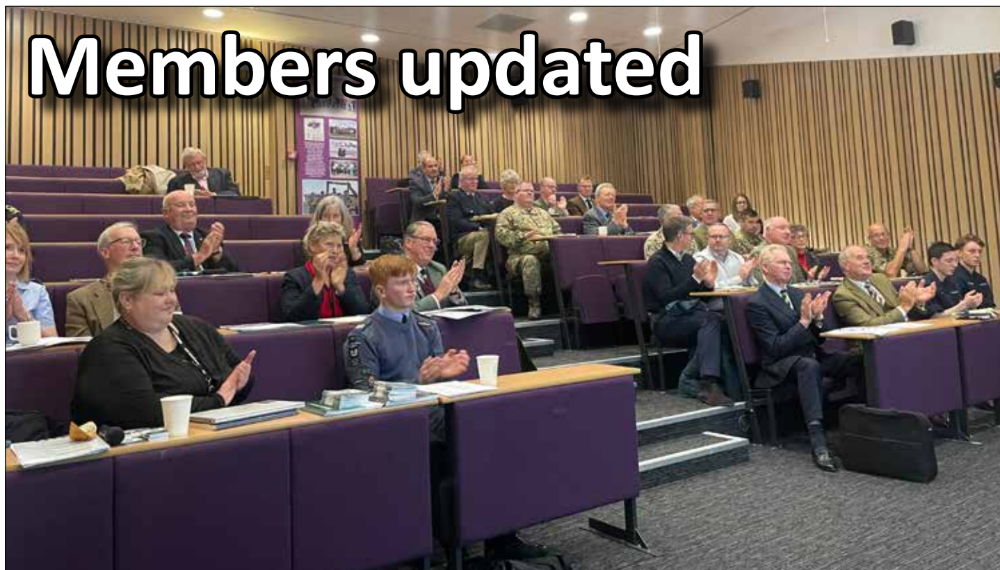
The members and attendees at the Northern Area Meeting enjoyed the engaging presentations.