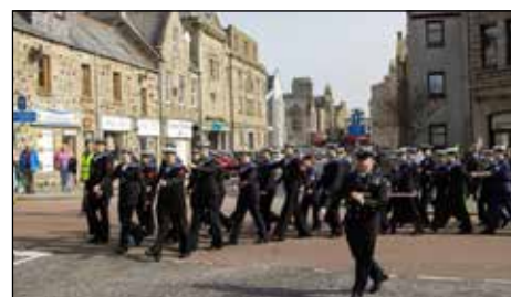
The Sea Cadets looked very smart.