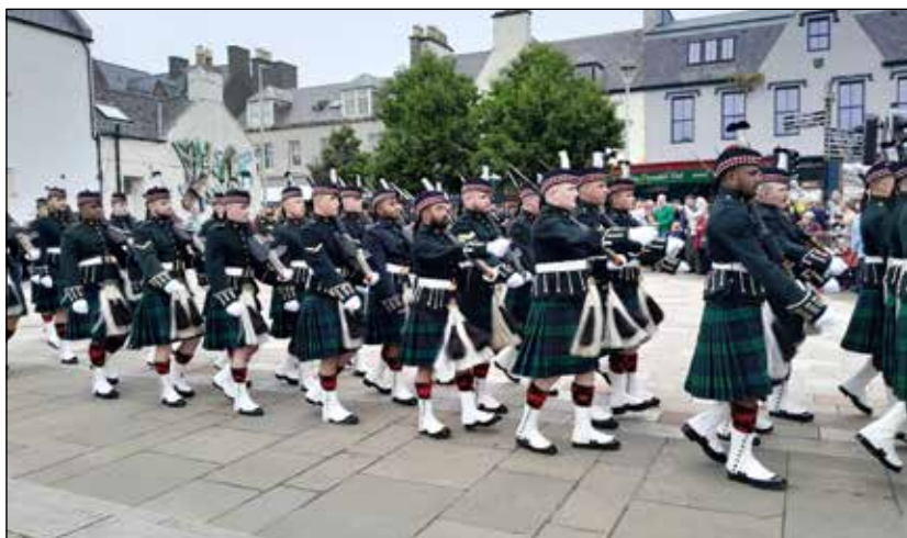
Soldiers from The Royal Regiment of Scotland in Perceval Square.