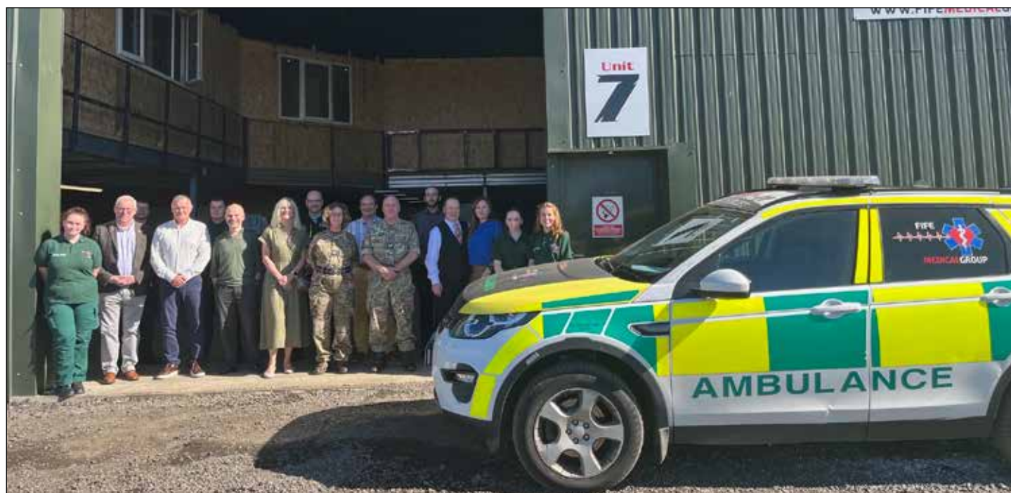
Highland Gold Network members at Fife Medical Group's Lochgelly HQ.

The next meeting takes place in Aberdeen on 18 February, 2025.