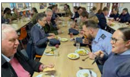
Visitors, cadets and Adult Volunteers enjoyed a meal together.