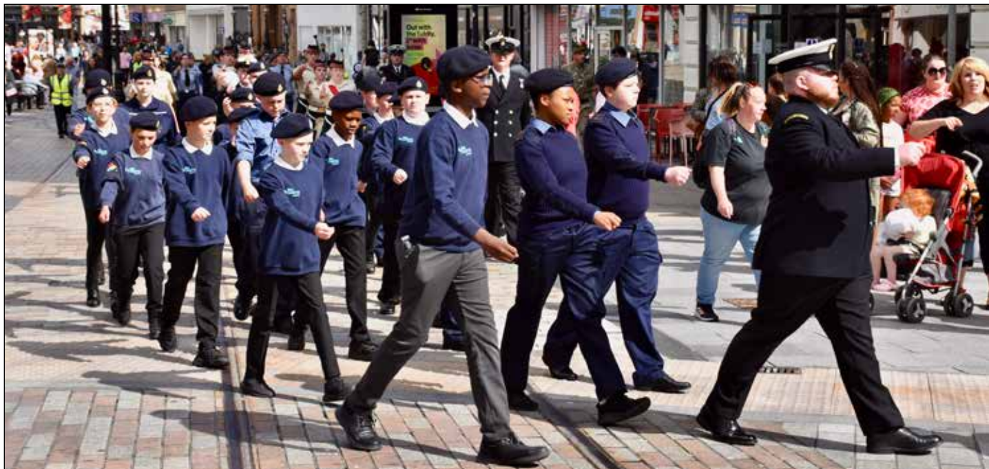
Sea Cadets parading through Dundee City Centre.

Dundee Sea Cadets paraded its colours through Dundee on 10 August to mark the unit's 85th birthday.