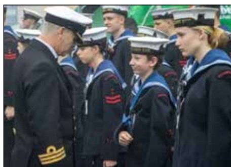
A cadet's injured arm attracted attention.