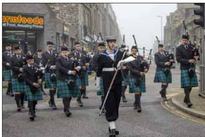
Cadets marching through a misty Fraserburgh.