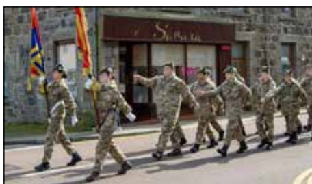
2 Highlanders march through the town.