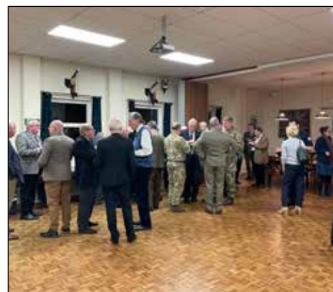
Members networking over supper at Queen's Barracks.