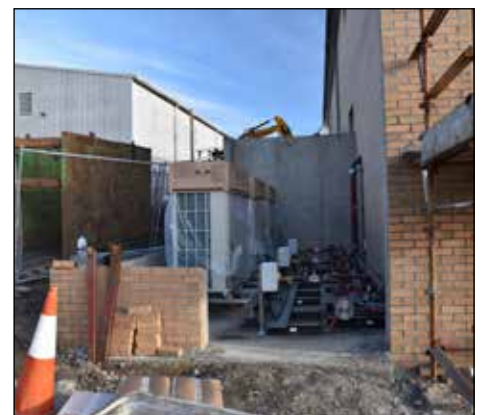
From left: The main, open-plan office space; the drill hall; and the three air source heat pumps that will heat the building.