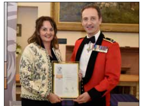
From left: Simplicity in Mind, Stirling Highland Games, and The UKSI Limited.