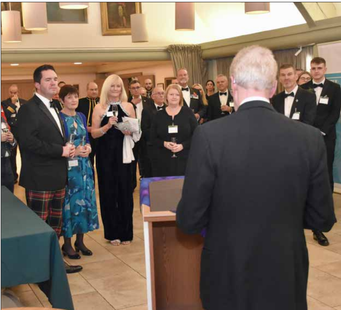
Guests being welcomed to the 2024 Defence Employer Recognition Scheme Gold Awards at The Black Watch Castle and Museum by the Chief Executive.