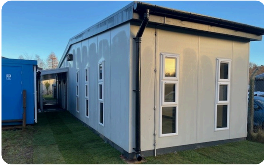
The new extension was built off site.