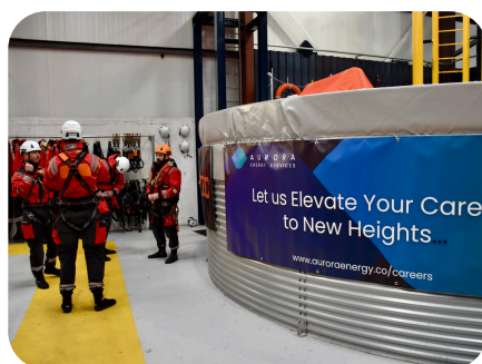
Capturing the action and (right) the learners and an instructor beside the sea survival tank.