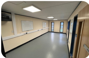
Inside the new space.

Groundworks started on 11 September 2025. Following that the prefabricated units were craned over the boundary fence and laid down on the new foundations, creating a fresh space that will be in use for the next 20 years. The work was completed in time for the resumption of cadet training following the festive break.